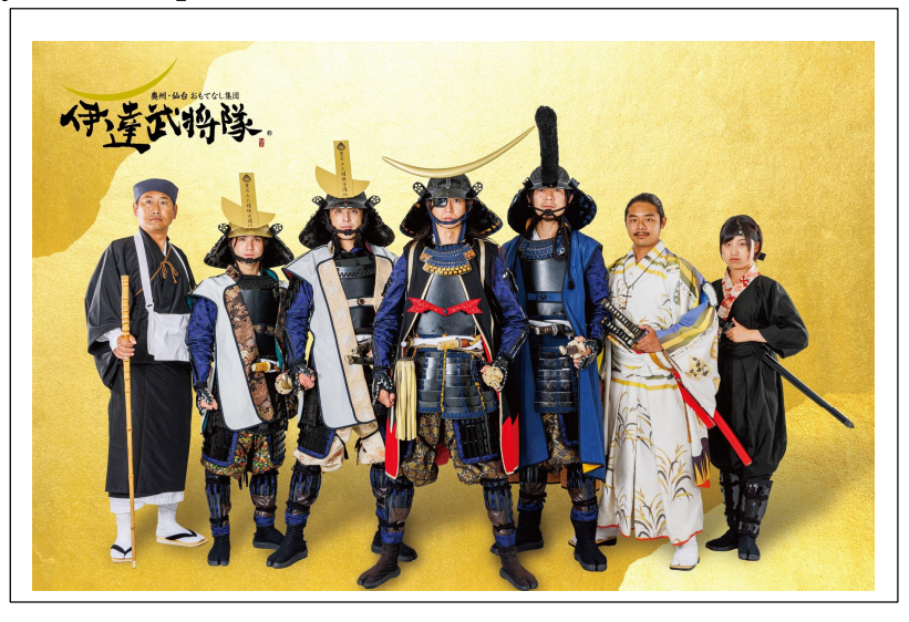
History Experience: Date -Samurai Performers