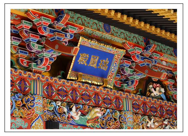
History Experience: Zuihoden Mausoleum Guided by samurai performers

Participants will experience Sendai's <u>rich history and local flavors</u>. Participants will explore <u>an iconic historic landmark</u>, guided by the <u>samurai performers</u>, <u>try making a beloved local specialty</u>, <u>Sasa Kamaboko*1</u>, and <u>enjoy shopping</u> for local souvenirs. The tour also includes a visit to <u>the Tsunami Ruins</u> to reflect the region's recovery from the Great East Japan Earthquake.