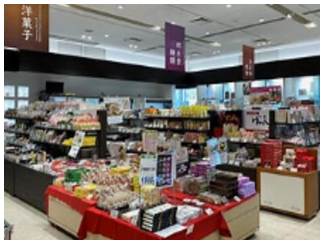
Fukushima Product Promotion Center