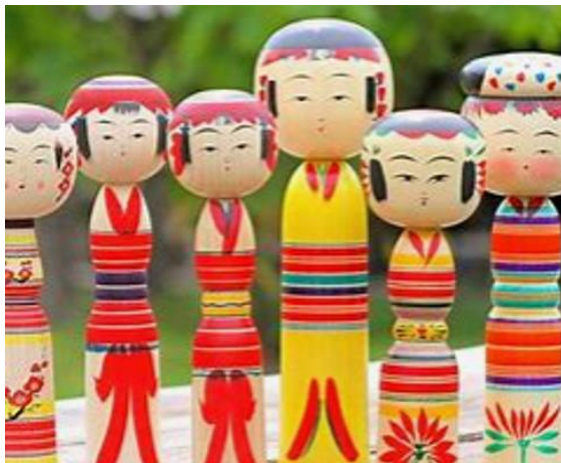
Yajiro Kokeshi Doll Village

*Kokeshi Doll - cute-looking souvenirs resembling Japanese people in traditional wear Kokeshi dolls are mostly used as children's toys, they are also symbols of hopes for bountiful harvests, wishes for good luck and fortune, and great appreciation for craftsmanship and culture.