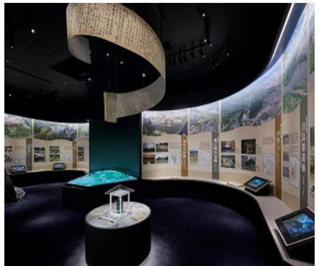
Hiraizumi World Heritage Information Center